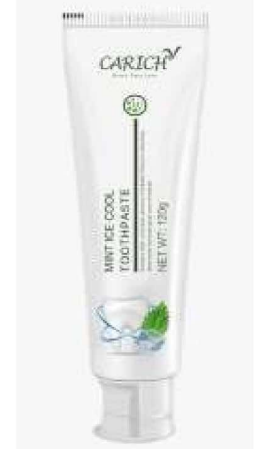
COOL MINT TOOTHPASTE