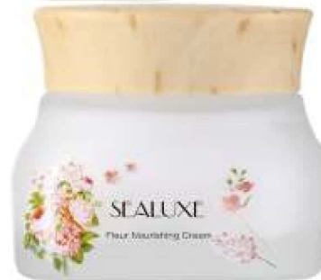
SEALUXE FLEUR NOURISHING CREAM