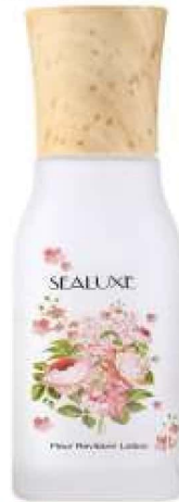
SEALUXE FLEUR REVITAXIN LOTION