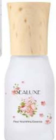
SEALUXE FLEUR NOURISHING ESSENCE