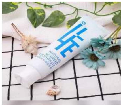
NATURAL SEAWEED TOOTHPASTE